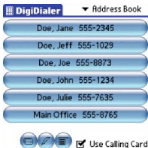
Figure 1: Main screen

DigiDialer has the ability to import names and telephone numbers from the built-in Palm Address Book, and also comes with seven different skins to customize its visual appearance and take full advantage of the newest 320x320 and 320x480 high-resolution color screens.