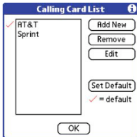
Figure 7: Calling Card List Dialog

The real power of DigiDialer comes into play when you add calling card information. DigiDialer will dial the entire sequence of keys for you, which can amount to dozens of digits. The Calling Card List dialog box (accessible from the menu, or using the small calling card button on the bottom of the screen) allows you to add new calling card information to your list.