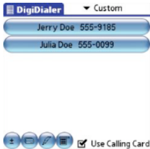
Figure 4: Custom mode

Although Address Book mode is the quickest way to get up and running with DigiDialer, Custom mode allows more flexibility. Select this mode through the popup menu in the upper-right corner of the main screen. While in custom mode, only records that have been explicitly imported or entered into DigiDialer will appear on the screen.