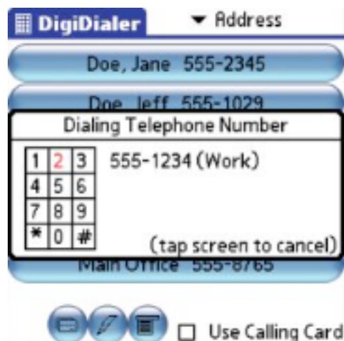
Figure 3: Dialing a telephone number

To dial a telephone number, simply tap on one of the long bars. For example, tapping on “Doe, John” will cause your Palm to emit the tones necessary to dial “555-1234”. A dialog box will appear, displaying the telephone number and an animated keypad.