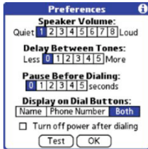
Figure 9: Preferences

DigiDialer has several customizable preferences that you can change. You may need to experiment with one or more values for DigiDialer to work most efficiently with your telephone. To access these preferences, tap on the title bar to pull down the menu. Then select "Preferences".