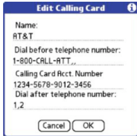
Figure 8: Editing a Calling Card

When you tap on a button on the main screen, DigiDialer will dial #1 and #2 above, then the person's telephone number, and then #4 above. This allows you to dial *70 for example to turn off call waiting, then 1-800-xxx-xxxx to dial AT&T, then your person's telephone number, then a couple digits to finalize the transaction. You'll never need to type these dozens of numbers again!