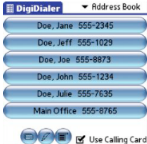
Figure 2: Address Book mode

DigiDialer 2.0 introduces a significant new feature: Address Book mode. This mode is selectable from the popup menu in the upper-right corner of the main screen. A frequently requested feature, Address Book mode automatically displays all telephone numbers that have been entered into the standard Palm Address Book application. This means you don't need to spend any time importing data, nor do you need to manually keep DigiDialer up-to-date.