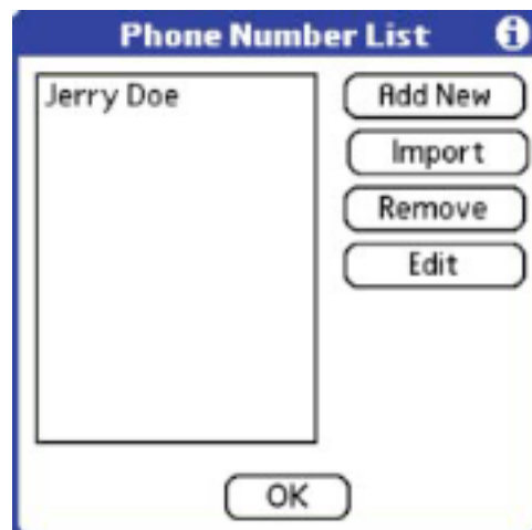
Figure 5: Custom Phone Number List Dialog

To add a record while in Custom mode, tap the leftmost “+/-” button on the bottom of the screen, or select “Setup Phone Numbers” from the menu. A “Phone Number List” dialog box will appear.