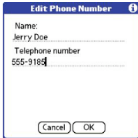
Figure 6: Adding or editing a custom record

The Phone Number List dialog box allows you to add new names and telephone numbers to your list. You can either tap "Add New" to enter information manually, or tap "import" to import information from the built-in Palm Address Book. After you have added at least one record, you can "remove" it or "edit" it using the two other buttons.